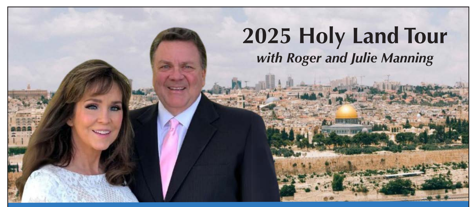
November 7-17, 2025

Welcome to an unforgettable experience! Immersing yourself in the spirit of the Holy Land will help provide a greater appreciation for the numerous sacred sites and events as recorded in the Bible. The focus of our tour will be on the life and ministry of Jesus Christ. We will visit many sacred, traditional areas of Jerusalem (Mt. of Olives, Lazarus' Tomb, Gethsemane, Golgotha, Holy Sepulcher), Galilee, Nazareth, Masada, the Dead Sea, and Bethlehem. We are confident you will sense an increased love for and knowledge of the Scriptures and strengthen your testimony and conversion to our Savior, Jesus Christ.